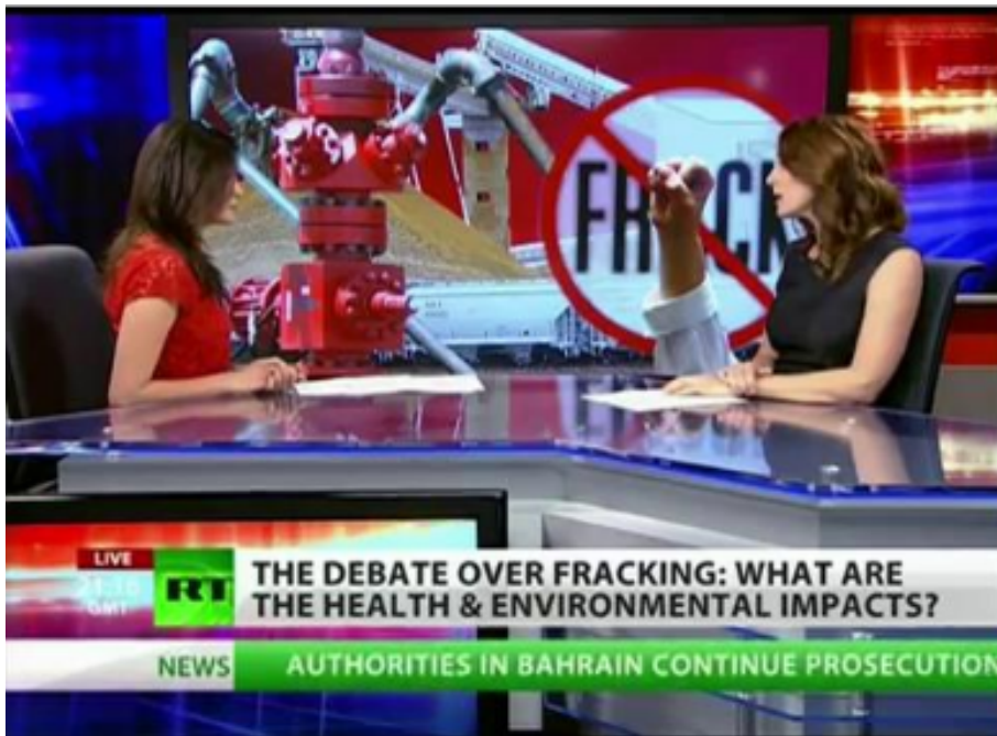
Screengrab from RT featured in the ODNI report.

Those in Congress representing the interest of the extractive industries have seized on this charge, equating anti-fracking coverage with “divisive messages” such as hate speech. The Washington Times ( 9/26/17 ) reported on a congressional probe into Russian “fracking-related social media ads.” The committee rallied against