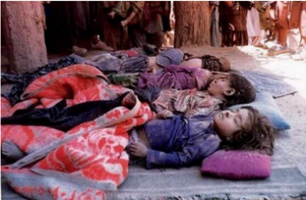
Afghanistan Victims of a February, 2012 US air strike that killed 8 children in Kapisa, Afghanistan.

to attack the United States again. Trump had the advantage of knowing that President Obama's approach had failed despite repeated bombings in Pakistan and working with Afghan troops, but that didn't alter his course.