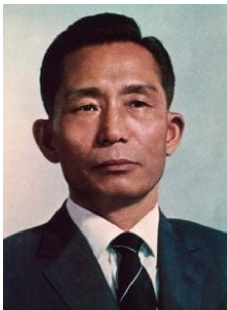
Park Chung Hee

Left as it was with an obsolete industry and a financial system formerly controlled by the Japanese [5], the Syngman Rhee government would use it, with the blessing of the USAMGIK, to reward and comfort the upper class's loyalty, since after all they were the basis of its political power. The new industrialists made thriving business, not thanks to their own investments, for they hardly had any equity , but thanks to tax incomes and U.S. subsidies that the dictatorship generously handed out. Moreover a strictly protectionist policy protected them from foreign competition. Later the Park Chung Hee dictatorship (1961-1979) would create industrial and financial conglomerates called chaebols .