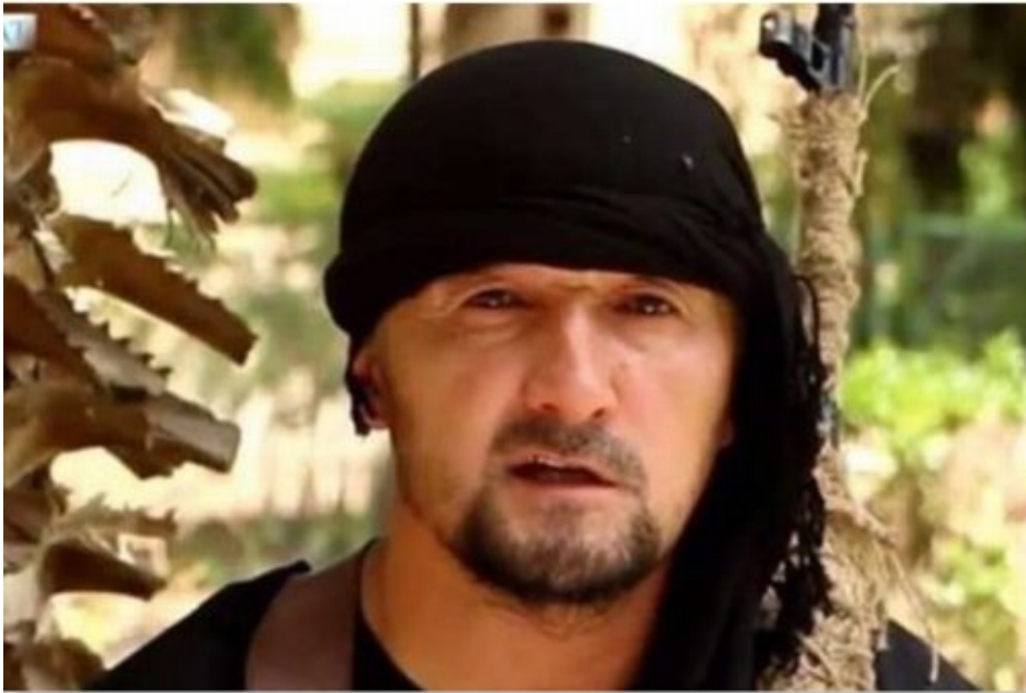
Gulmurod Khalimov, the Pentagon's ISIS man in Syria, or Russia, or wherever they plant him

Department, which offered a bounty of up to $5 million for information leading to his capture in 2015. Several European intelligence agencies also claimed that Al-Shimali was involved in the November 2015 Paris attacks. Now you might think that, with the news that this brutal killer responsible for so much carnage in Syria and France has been taken out of action, the US State Dept. and the French government might put aside their ridiculous anti-Russian ideology and make a public statement of congratulations to the Russian and Syrian militaries and governments for this admirable achievement. But you'd be wrong. They have nothing to say; in fact, they are probably having a hard time controlling their urge to scream bloody murder that Russia just killed some of their favorite assets.