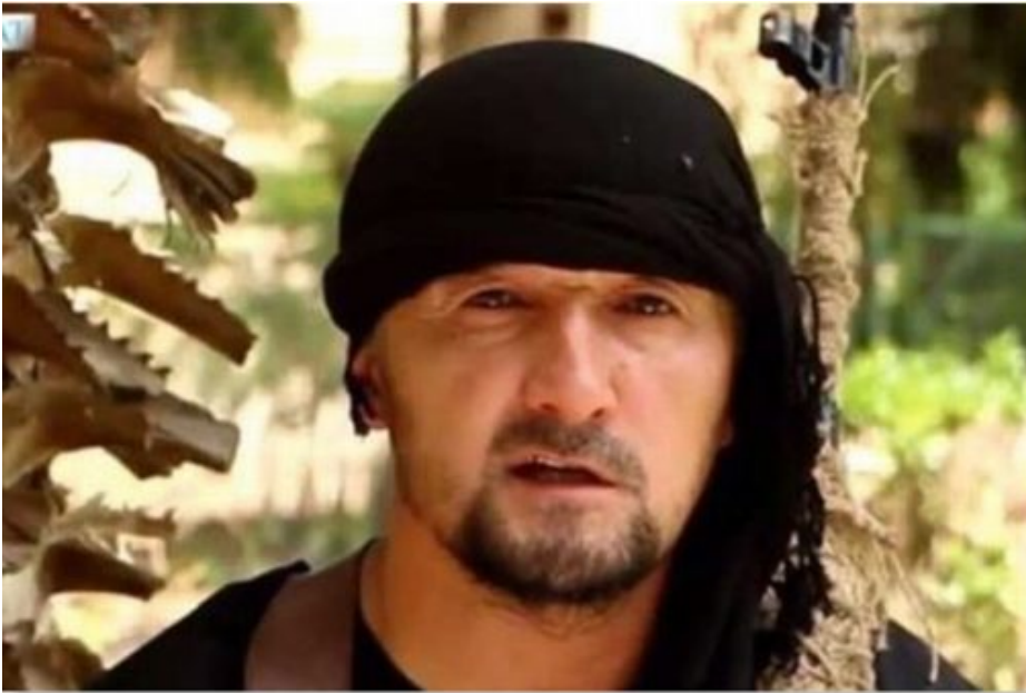
Gulmurod Khalimov, the Pentagon's ISIS man in Syria, or Russia, or wherever they plant him

Department, which offered a bounty of up to $5 million for information leading to his capture in 2015. Several European intelligence agencies also claimed that Al-Shimali was involved in the November 2015 Paris attacks. Now you might think that, with the news that this brutal killer responsible for so much carnage in Syria and France has been taken out of action, the US State Dept. and the French government might put aside their ridiculous anti-Russian ideology and make a public statement of congratulations to the Russian and Syrian militaries and governments for this admirable achievement. But you'd be wrong. They have nothing to say; in fact, they are probably having a hard time controlling their urge to scream bloody murder that Russia just killed some of their favorite assets.