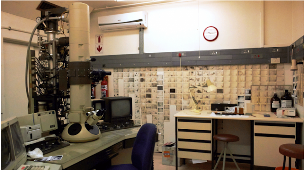
Image: South Africa's Rodeplaas Research Laboratories, where genocidal scientists under Project Coast sought to weaponize vaccines to sterilize, even eradicate the nation's black population.

Perhaps the most frightening impending disparities humanity now faces are those in the fields of biotechnology and artificial intelligence.