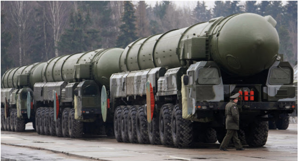
Image: Russian mobile nuclear missiles and the reason why the United States never used nuclear weapons again.

With each form of tactical and technological disparity manifesting itself in military aggression, subjugation, exploitation, and immeasurable injustice, attempts to diminish that disparity have helped strike a balance of power.