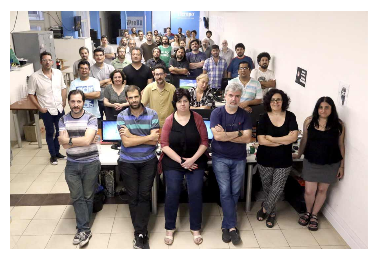
Tiempo Argentino team

In December of 2015, the country's media panorama changed along with the political rupture with the election and inauguration of Mauricio Macri as president after 12 years of Kirchners in office, with <u>Néstor</u> (2003-2007) and <u>Cristina Fernández</u> (2008-2015).