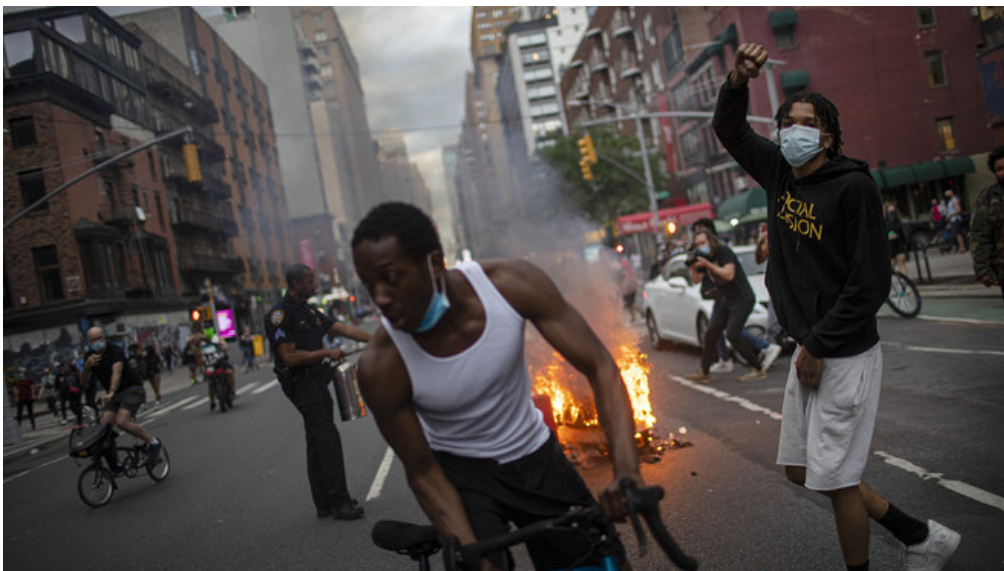
New York City demonstrations against police brutality and the murder of George Floyd

Just 45 minutes after the curfew went into effect on May 31, riot police charged the youth-dominated crowd gathered outside police headquarters on Third Street downtown. The police used teargas, pepper spray, pellets and rubber bullets. There were unjustified arrests while several participants along with journalists were hit by the gas and rubber bullets. Several journalists were detained after they had identified themselves as media workers. (See this )