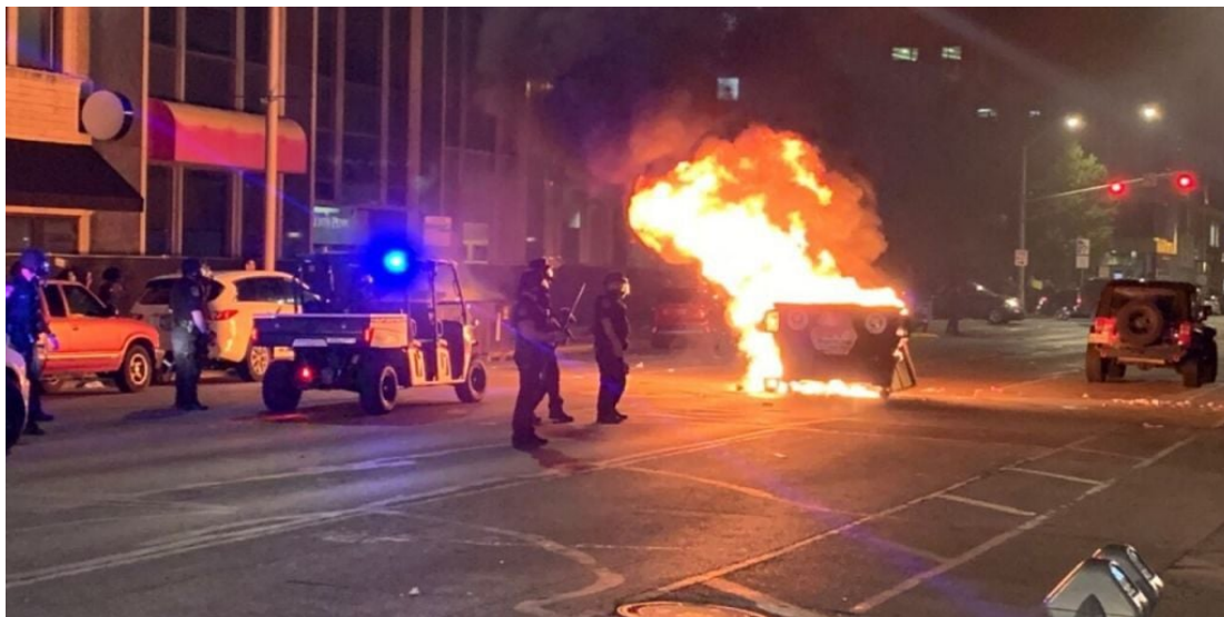
Indianapolis rebellion leave two dead at the hands of the police

Meanwhile Indianapolis police have attacked demonstrations prompting retaliatory actions against property. News reports say that 30 businesses have been damaged. Four people were shot over the May 30-31 weekend, one fatally. Police claim that their officers were not responsible although this has not been verified independently. (See this )