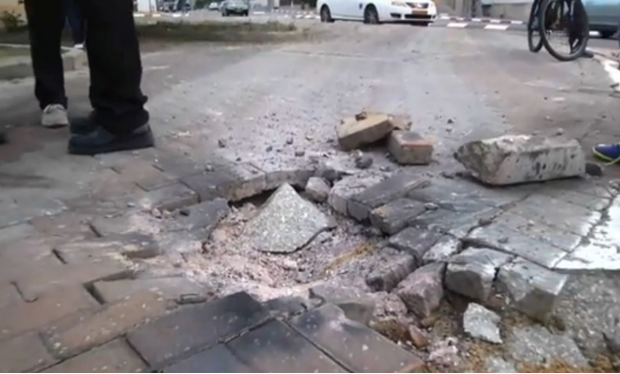
Damage caused in Gaza by Israeli projectiles: