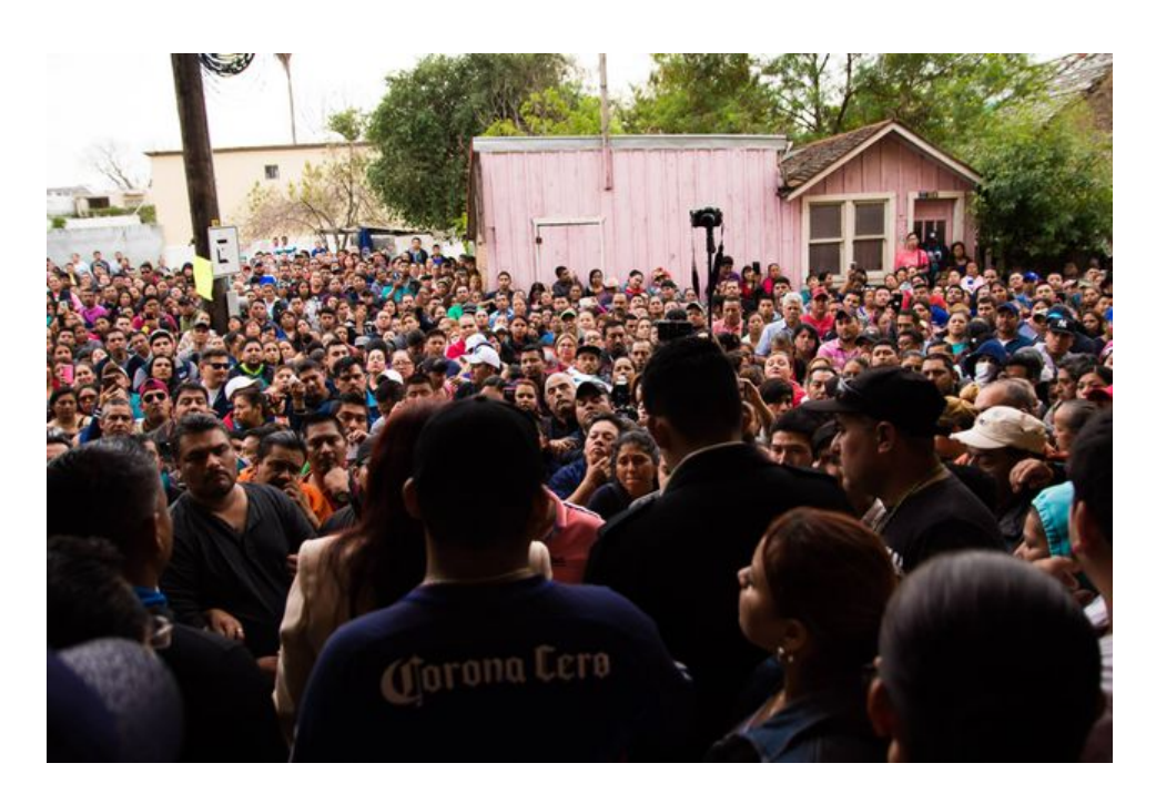
Workers confront the union leader outside of the headquarters on Thursday

The strike could very soon disrupt global supply chains in the United States, Canada and Asia. Industry experts estimate that the strike has already cost the maquiladora industry $20 million, or $23,000 per minute. The strike is affecting major suppliers to the "Big Three" automakers—GM, Ford and Fiat-Chrysler—as well as other manufacturers. Factories that are on strike include Autoliv, Inteva, Starkey, Edemsa, Aipsa, Cepillos, STC, Polytech, Kemet, Tyco, Parker and AFX.