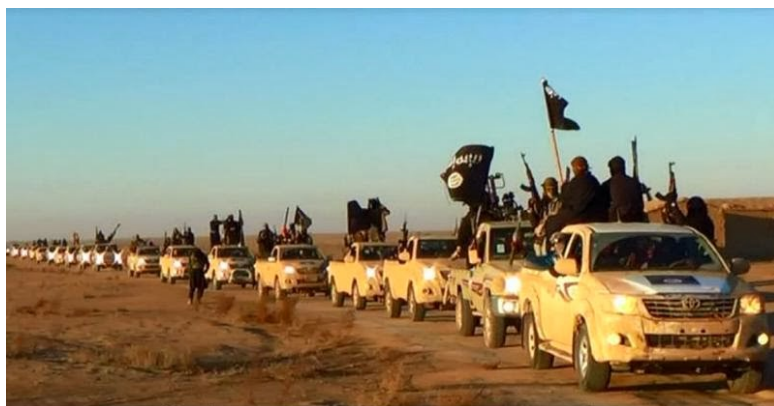
Image: ISIS has convoys of brand new matching Toyota's the same vehicles seen among admittedly NATO-armed terrorists operating everywhere from Libya to Syria, and now Iraq. It is a synthetic, state- sponsored regional mercenary expeditionary force.

A senior U.S. official said the intelligence collected under the small [secret US drone] program was shared with Iraqi forces, but added: “It’s not like it did any good.” The rapid territorial gains by the Islamist forces loyal to Islamic State of Iraq and al-Sham, or ISIS, an al Qaeda offshoot, caught the U.S. by surprise, the officials said.