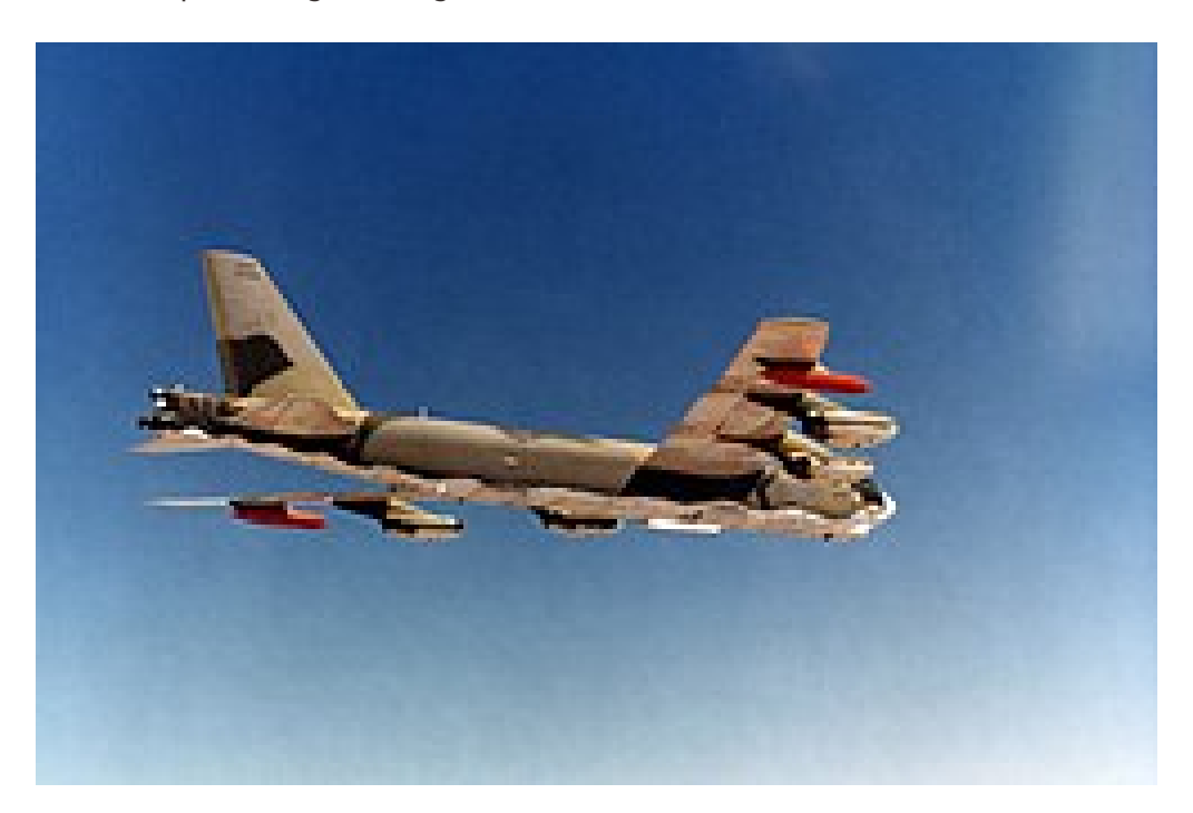
A B-52G, similar to the one that crashed at Thule Air Base. 1968 Thule Air Base B-52 crash - Wikipedia

at Thule base on Greenland despite the 1957 nuclear free zone policy. A B-52G Stratrofortress aircraft carrying four thermonuclear bombs crashed due to a human error, which caused a fire. Several hundred Danish and US American clean-up workers died from radiation poisoning causing cancer.