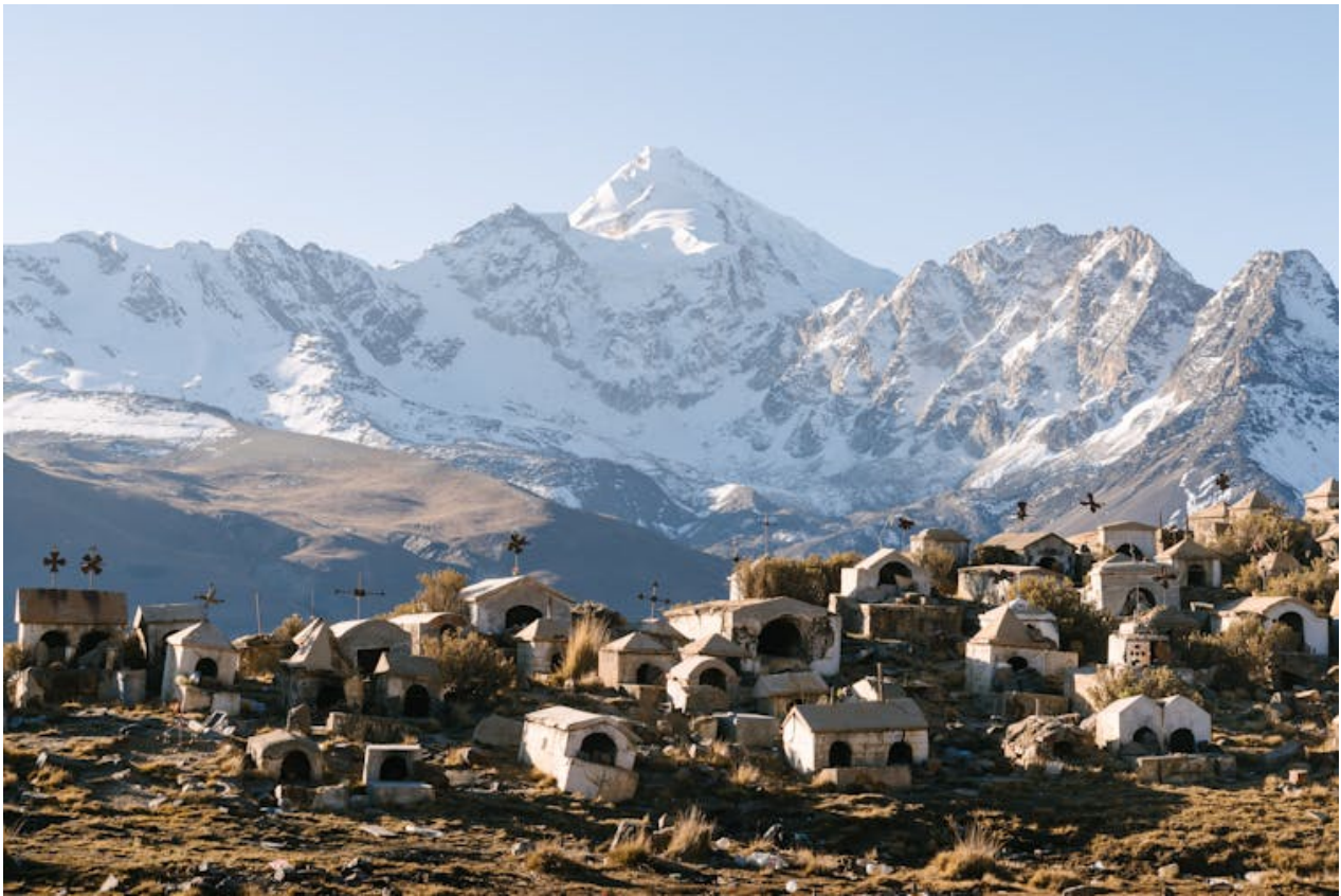
The Zongo glacier is found on the slopes of Huayna Potosi, one of Bolivia's highest mountains.

Crucially, the authors also found that the effect of black carbon depends on the amount of dust covering a glacier – if the amount of dust is higher, then the glacier will already be absorbing most of the heat that might have been absorbed by the black carbon. Land clearing is one of the reasons that dust levels over South America doubled during the 20th century.