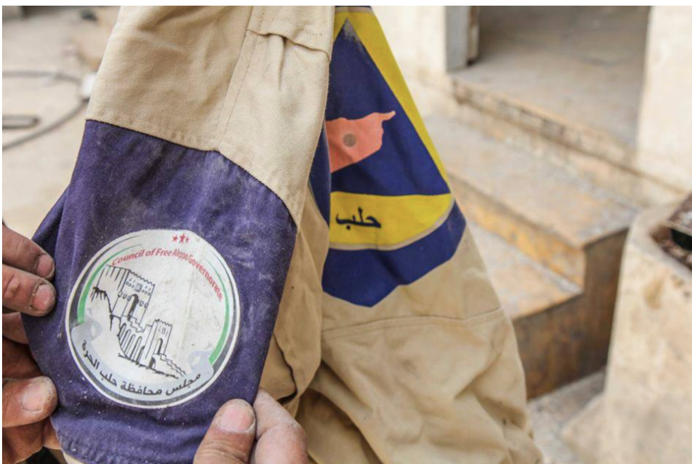
Emblem of a shadow council on White Helmet uniform