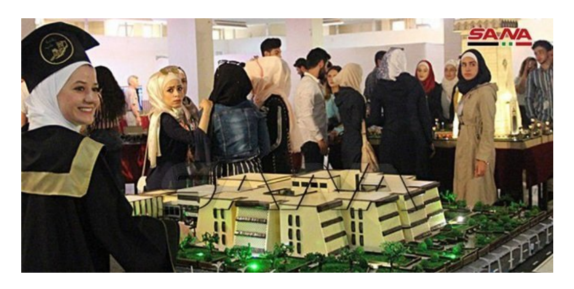
Architectural Engineering students show their projects.