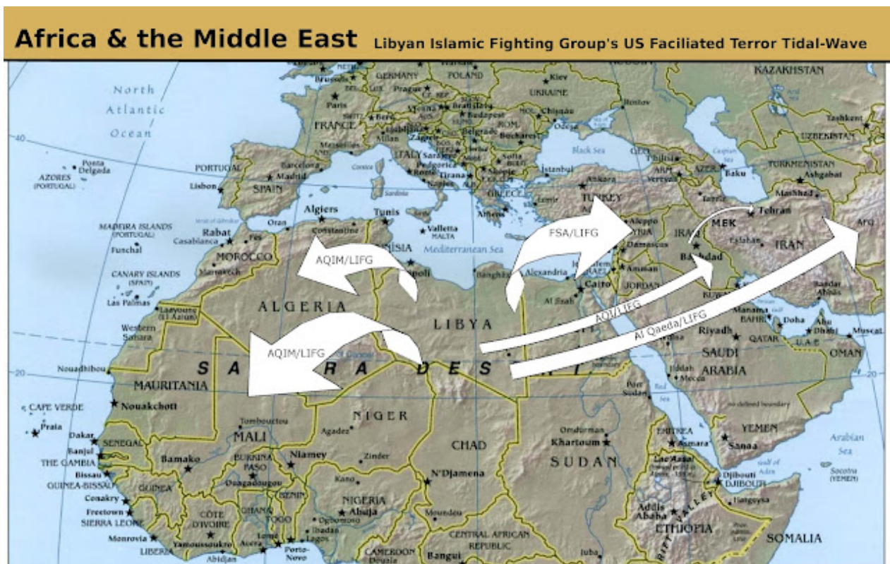
Image: NATO's intervention in Libya has resurrected listed-terrorist organization and Al Qaeda affiliate, LIFG. It had previously fought in Iraq and Afghanistan, and now has fighters, cash and weapons, all courtesy of NATO, spreading as far west as Mali, and as far east as Syria. The feared "global Caliphate" Neo-Cons have been scaring Western children with for a decade is now taking shape via US-Saudi, Israeli, and Qatari machinations, not "Islam." In fact, real Muslims have paid the highest price in fighting this real "war against Western-funded terrorism."