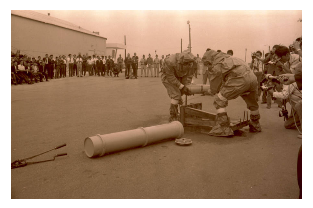
Okinawa, Japan. May 11, 1971.

15) Military personnel demonstrate how to handle an Agent Orange leak, apparently growing increasingly aware of how dangerous the chemical they'd been using really is.