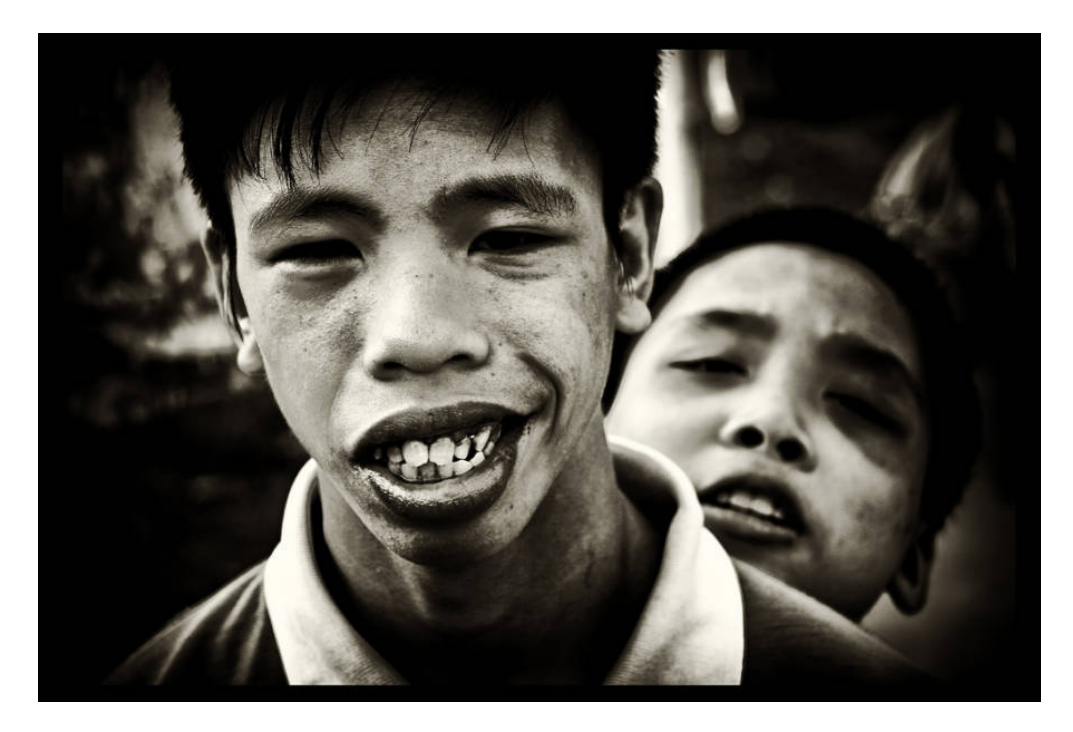
Hanoi, Vietnam. November 10, 2007.

The original source of this article is <u>The Mind Unleashed</u> Copyright © <u>Amanda Froelich</u>, <u>The Mind Unleashed</u>, 2018