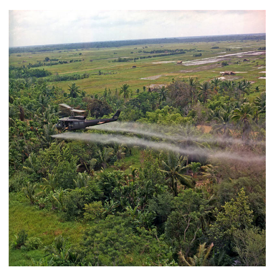
Mekong River, Vietnam. July 26, 1969.

14) A massive stack of 55-gallon drums full of Agent Orange waits to be poured over the people of Vietnam.