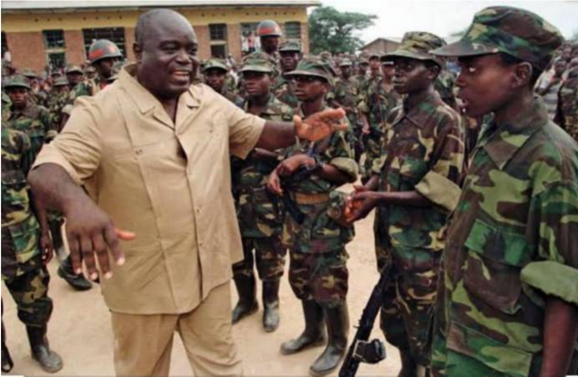
The late Laurent Kabila.

It is a wonder if this tactic was not also used when Huey Newton was assassinated exactly one year after he held a press conference from jail stating he refused release unless Geronimo Ji Jaga was released. [33] Tupac, who idolized Newton , was shot at by strangers in front of passive police exactly three years from the date of Newton's assassination. [34]