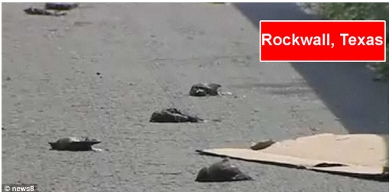
Road to nowhere: Dead birds litter a bridge on Highway 155 in Texas