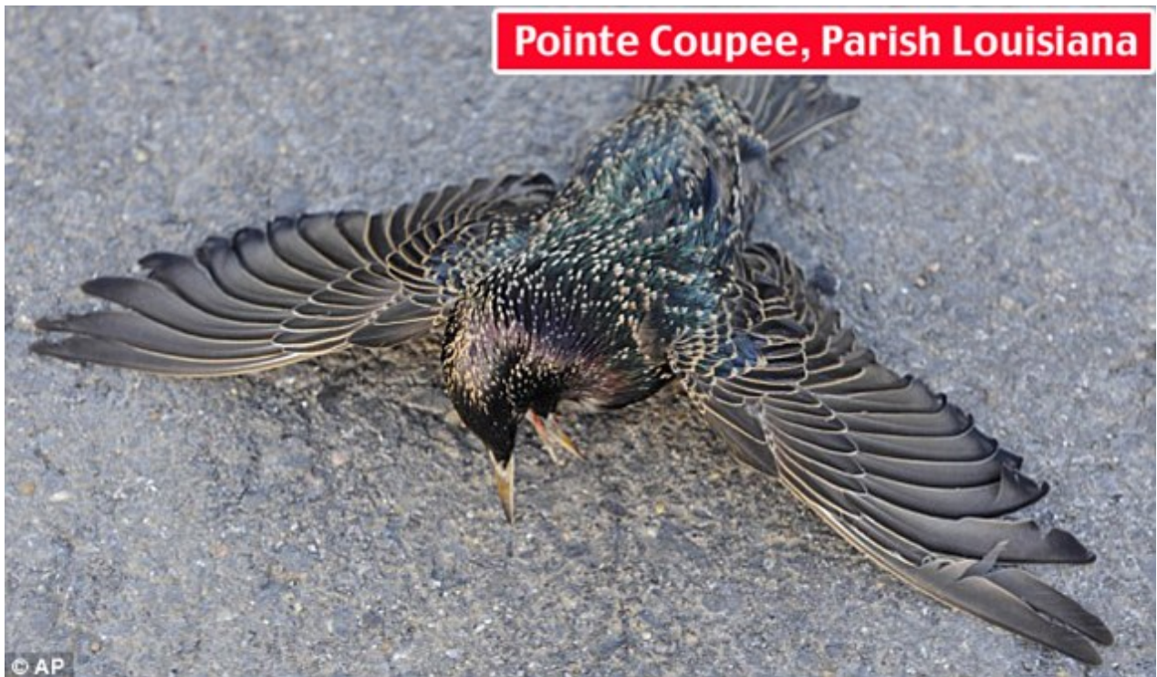
Mystery: A starling lies along the Morganza Highway in Pointe Coupee Parish, Louisiana. Experts said hundreds of birds may have died after hitting power lines