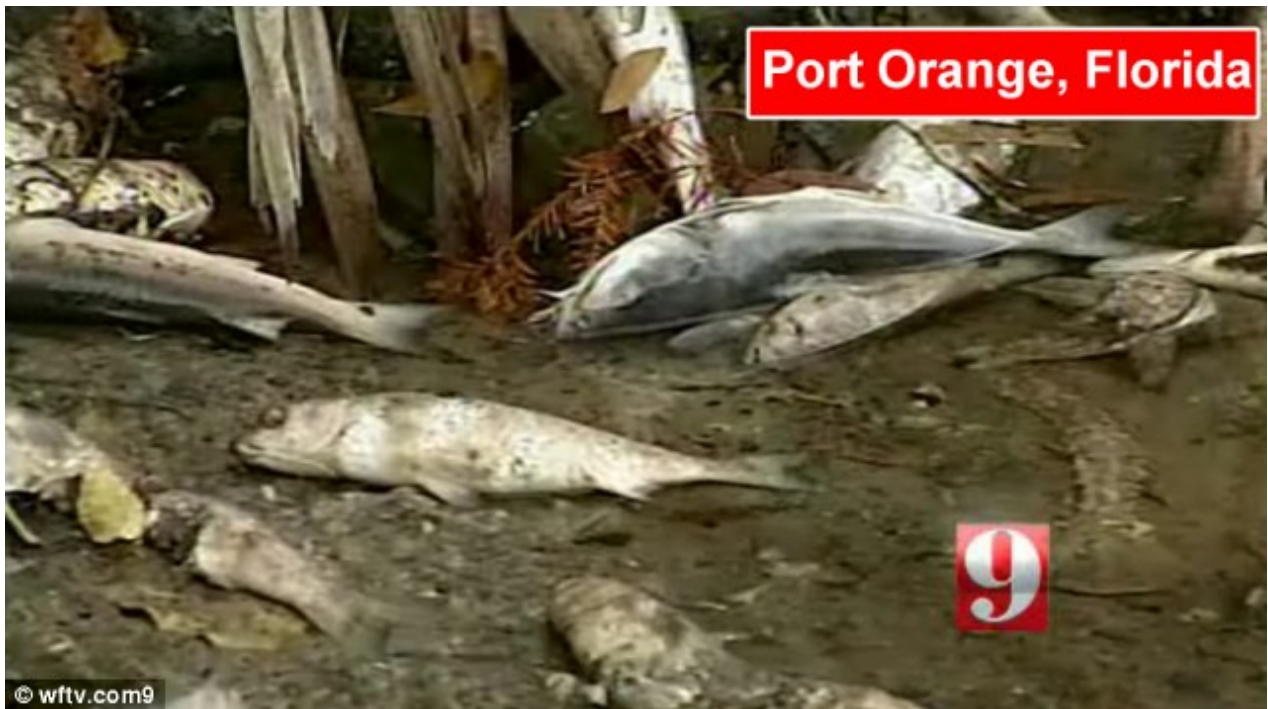
Problem on a large scale: Thousands of dead fish have washed up on the shores of Spruce Creek in Port Orange, Florida