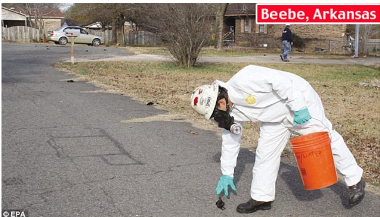
Confused: A worker stoops to pick up one of the many birds' carcasses which littered Beebe, Arkansas. Numerous theories are being put forward as to what may have killed them