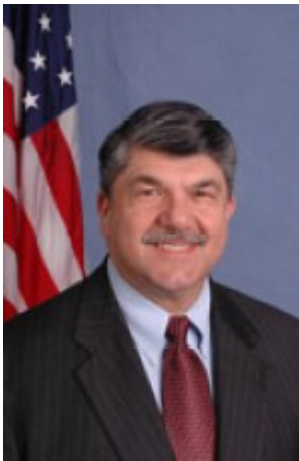
Richard L. Trumka