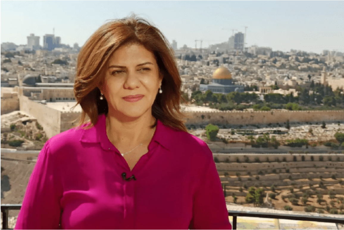
Shireen Abu Akleh

Let us not forget that the Interior Minister of Israel is a member of the Labor Party who supported the murder of the journalist, and the Labor Party supports the apartheid state and Liz Shuler supports the State of Israel.