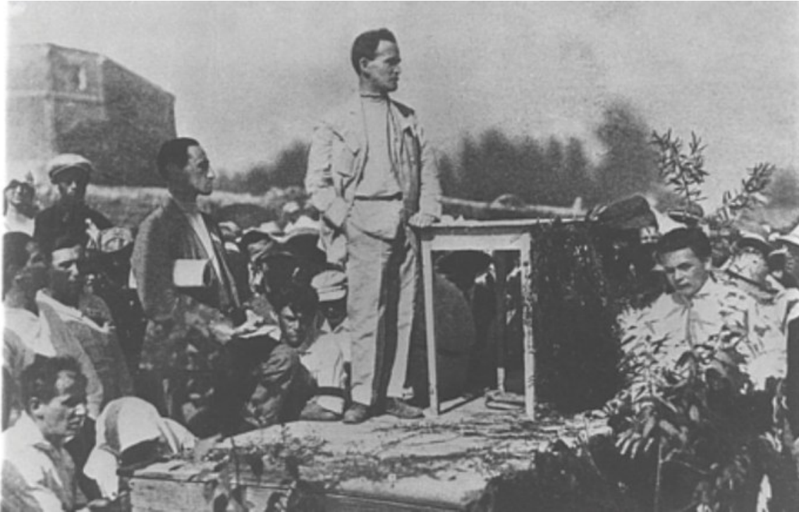
David Ben-Gurion addresses Histadrut members in 1924.

Ben-Gurion made it clear that there was no reason to respect Palestinian rights and that it was also clear that the Palestinians, understandably, would not give up their land without a fight.