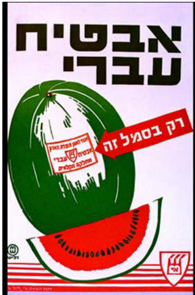
A Zionist poster from the 1930s calling on Jewish settlers to buy watermelons only produced in Jewish settlements.

Histadrut was the owner of 25% of the capitalist industries which often employed strikebreakers so that any independent activity of the working class would be shut down. Thus, any well-respected capitalist nation wishes and needs to expand its economic and political influence in the rest of the world, but for the moment, the Israelis decided that the Middle East was its back door.