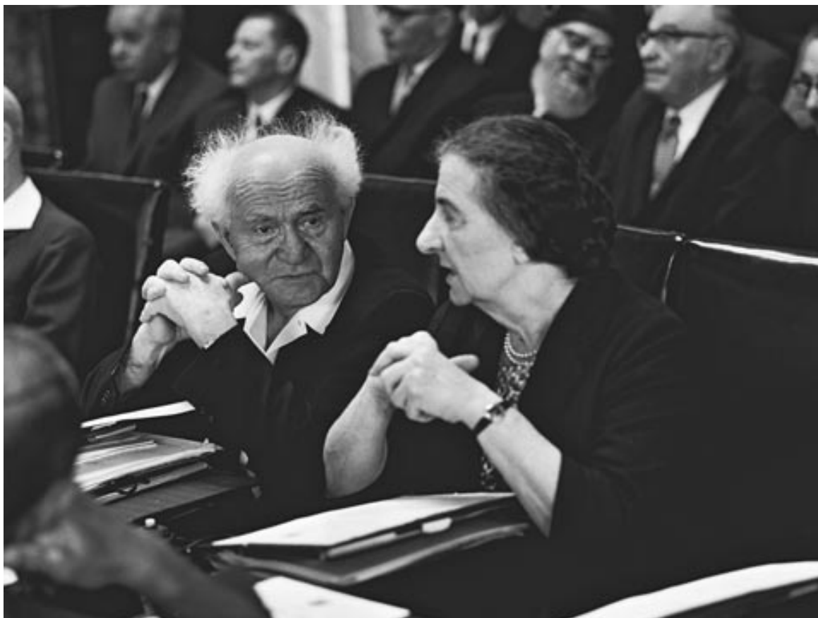
David Ben-Gurion and Golda Meir at the Knesset in Jerusalem in 1962.