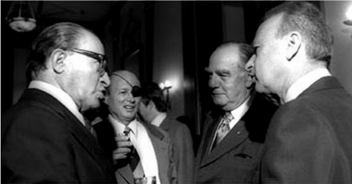
Menachem Begin, Moshe Dayan and Yitzhak Rabin visiting with South African Prime Minister B.J. Vorster (third from the left) in Jerusalem in 1976.