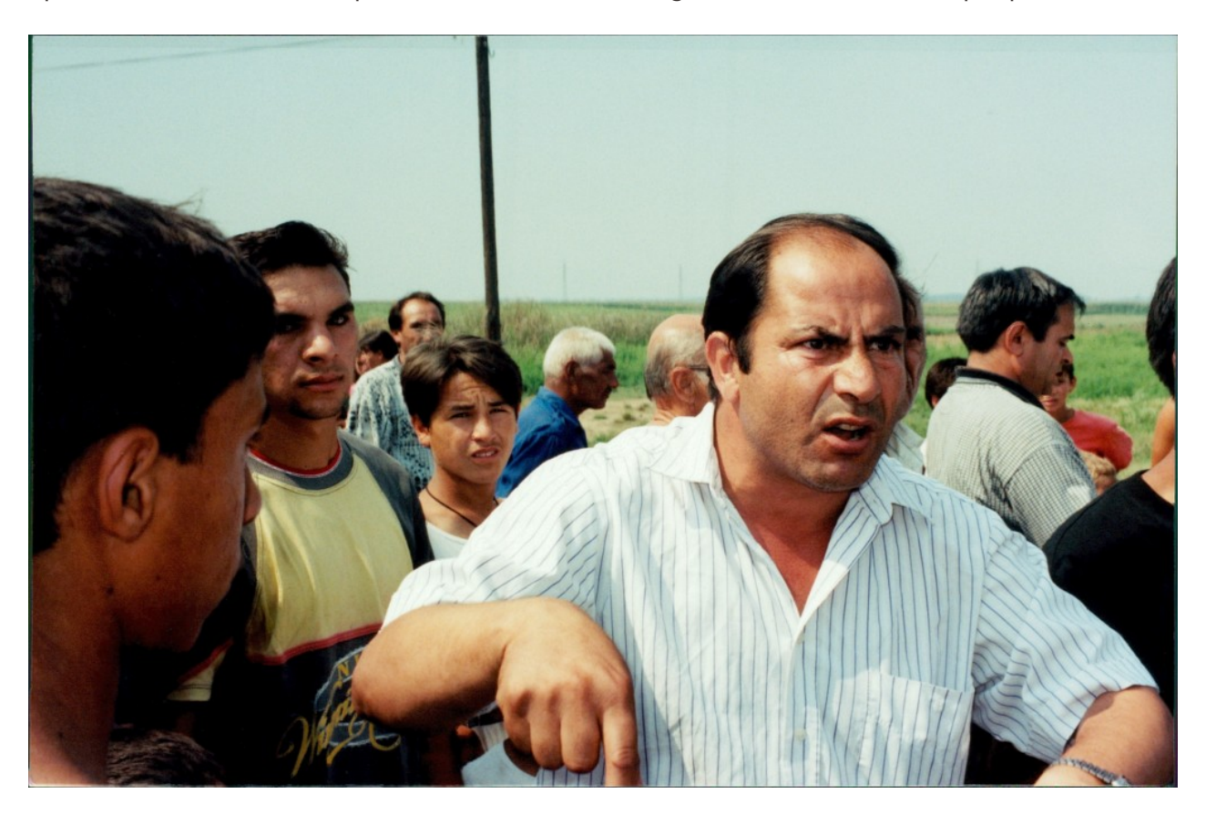
Caption: Roma refugees at Zemun Polje.

placing an enormous strain on the local population's personal finances. Those who had little opened their homes to help their fellow human beings. It said much for the people here.