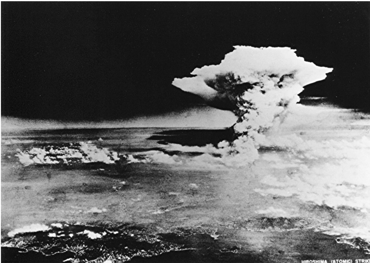
HIROSHIMA (ATOMIC) STRIKE

That Day: August 6, 1945, 8:15 AM: In the center of Hiroshima, just above Shima Hospital, it seemed like the sun had descended to the earth, followed by the sky blasting down in a Richter-10 cosmic quake from the gods, “rattling the earth’s axis,” scorching, searing, roasting, irradiating, blasting, and crushing everything and everyone below.