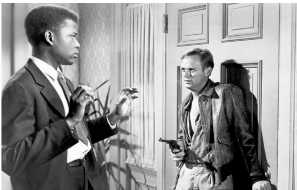
Sidney Poitier in No Way Out (1950).

In Sidney's first credited movie role, 1950's No Way Out , he plays a doctor who treats the criminal Richard Widmark, despite his abusive racism. The film, directed and co-written by Joe Mankiewicz, also depicts a race riot. In a way, No Way Out set the template for Sidney's most successful screen image, as the noble Black who loftily sacrifices himself for ignoble whites.