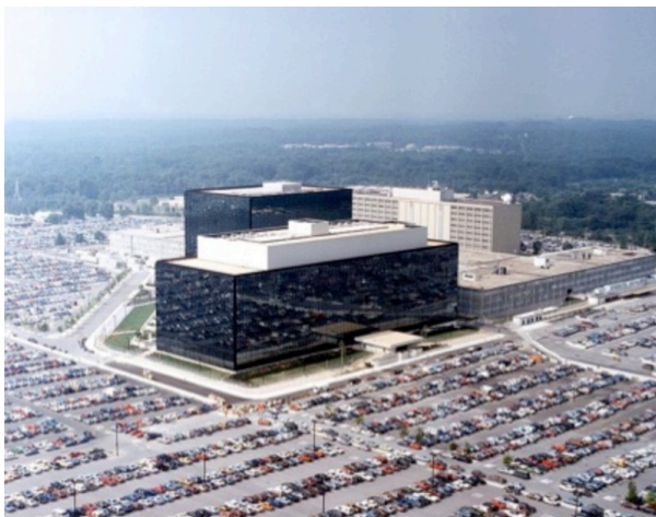
National Security Agency Headquarters, Fort Meade, Md

When Bradley Manning disclosed an estimated 700,000 classified documents in 2010, he was only 22 years old and held the second lowest rank in the U.S. Army. When Edward Snowden escaped from the United States in June of 2013 with a mass of secret material, he was not even an employee of the US government; he worked for a consulting firm. The 29-year old Snowden did not graduate from college, but like Manning, he held a "Top Secret" clearance and was in a position that gave him wide access to information the US government labels secret. 19 Why were these two young men selected to serve as guardians of the American "government of secrets?" The answer is that the body of information classified by the U.S. government is so vast that a huge army of operatives must access this "secret" information in order to do their jobs every day. According to the annual report of the U.S. Director of National Intelligence, more than four million people hold a security clearance that enables them to view classified information. 20 Among them, an astounding 1.4 million hold the "Top Secret" clearance, just like Manning and Snowden did.