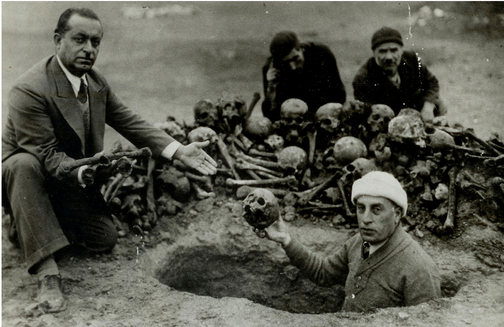
A group of men excavate the remains of victims of the Armenian genocide in modern day, Deir ez-Zor, Syria, 1938.

Much of what the Kurds claim as their own unique culture is actually borrowed from older cultures, such as the Assyrians, Armenians and Suryoye. In fact, much if not all of the land in Eastern Turkey that the Kurds claim as their own once belonged to the Armenians. It is hardly surprising, then, that the Kurds assisted in the Turkish genocide of Assyrians and the 1915 genocide of Armenians .