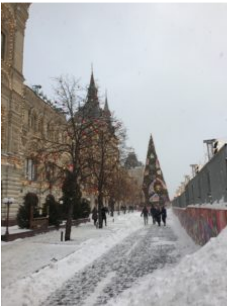
A wintery scene in Moscow, near Red Square.

President-elect Trump said a few days ago that his team will have a “full report on hacking within 90 days.” Whatever the findings of the Trump team turn out to be, they will no doubt be greeted with due skepticism, since Mr. Trump is in no way a disinterested party.