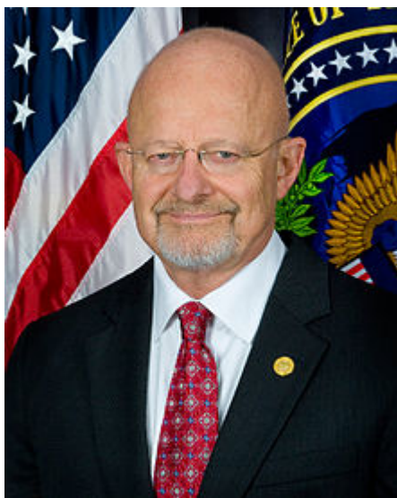
James Clapper, Director of National Intelligence.

We strongly suggest that you ask NSA for any evidence it may have indicating that the results of Russian hacking were given to WikiLeaks. If NSA can produce such evidence, you may wish to order whatever declassification may be needed and then release the evidence. This would go a long way toward allaying suspicions that no evidence exists. If NSA cannot give you that information – and quickly – this would probably mean it does not have any.