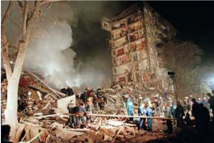
Image on the right: A picture of one of 1999 Russian apartment bombings .

(34) Senior Russian Senior military and intelligence officers admit that the KGB blew up Russian apartment buildings in 1999 and falsely blamed it on Chechens, in order to justify an invasion of Chechnya (and see this report and this discussion ).