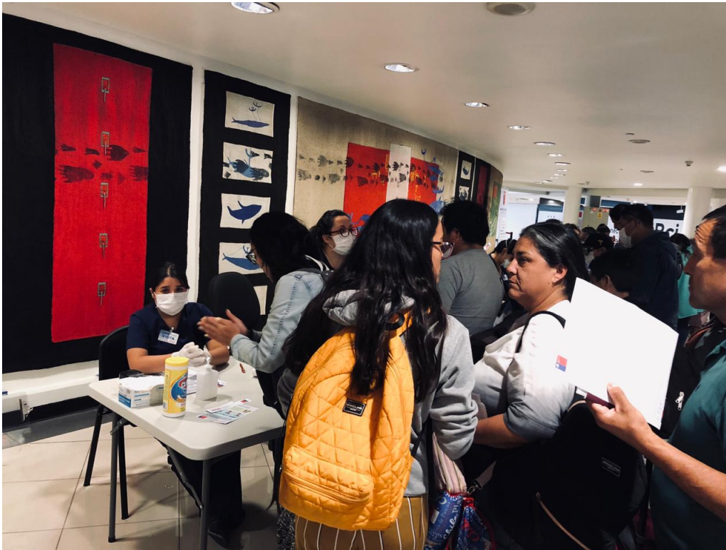
Coronavirus check at Santiago Airport, Chile

Santiago airport took the coronavirus seriously. There were several checkups. End of the games.