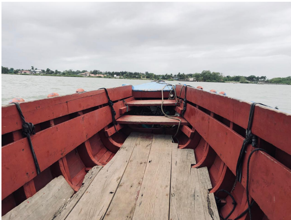
Empty crossing of Suriname River

I filmed the Suriname River and the rainforest of Suriname, to show the contrast with Borneo.