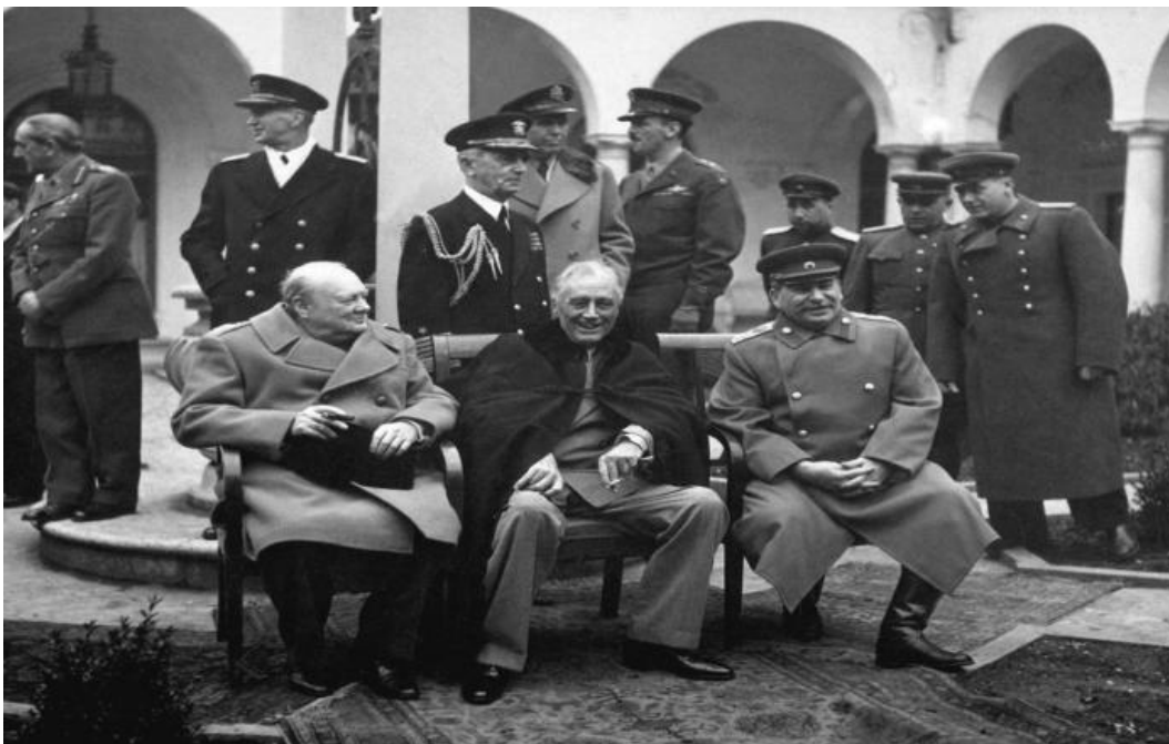
Famous photograph of Big 3 at Yalta—Winston Churchill, Franklin D. Roosevelt and Joseph Stalin.