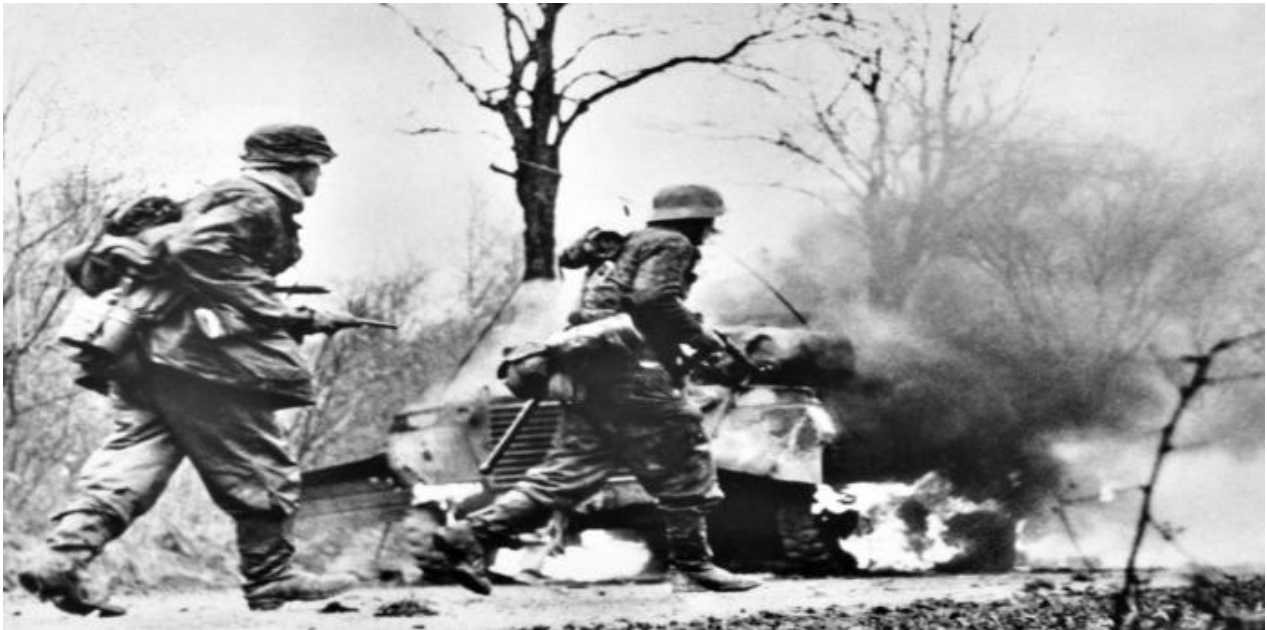
Scene from the Battle of the Bulge.

confrontation in the Ardennes represented a serious setback for the Americans. Von Rundstedt's counteroffensive did eventually end in failure, but initially the German pressure was considerable.