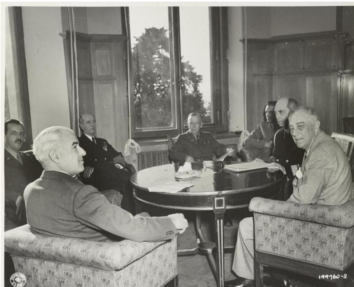
Yalta American Delegation in Livadia Palace from left to right: Secretary of State Edward Stettinius, Maj.

Conversely, to obtain the Soviet leader’s ratification of Germany’s division into occupation zones and his acceptance of other arrangements that were advantageous to themselves, the Americans and the British also indulged Stalin in some respects. In return for Stalin’s renewed commitment to eventually declare war on Japan, for example, Roosevelt offered American assent to the Soviet recuperation of the Far Eastern territories that czarist Russia had lost as a result of the Russian-Japanese War of 1904-05. [12]