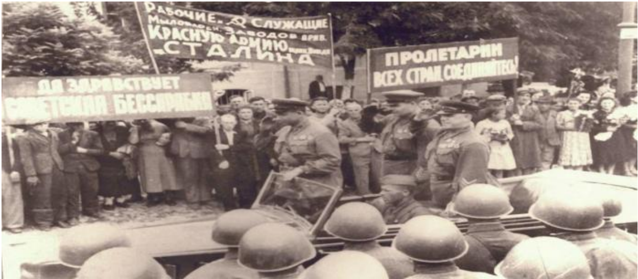
Soviet parade after liberation from Nazi rule in North Bessarabia in Romania.

Red Army. However, this symmetry was far from perfect. First, until the summer of 1944 the Soviets continued to fight almost exclusively in their own country. It was only in the fall of that same year that they liberated neighbouring countries such as Romania and Bulgaria, states which could hardly rival Italy and France.