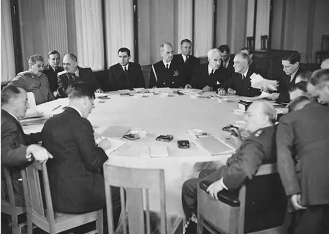
Leaders of the Big Three at the negotiating table at the Yalta conference.

Conservatives have compared FDR's performance at Yalta to British Prime Minister Neville Chamberlain's appeasement of Hitler at the Munich conference in September 1938.