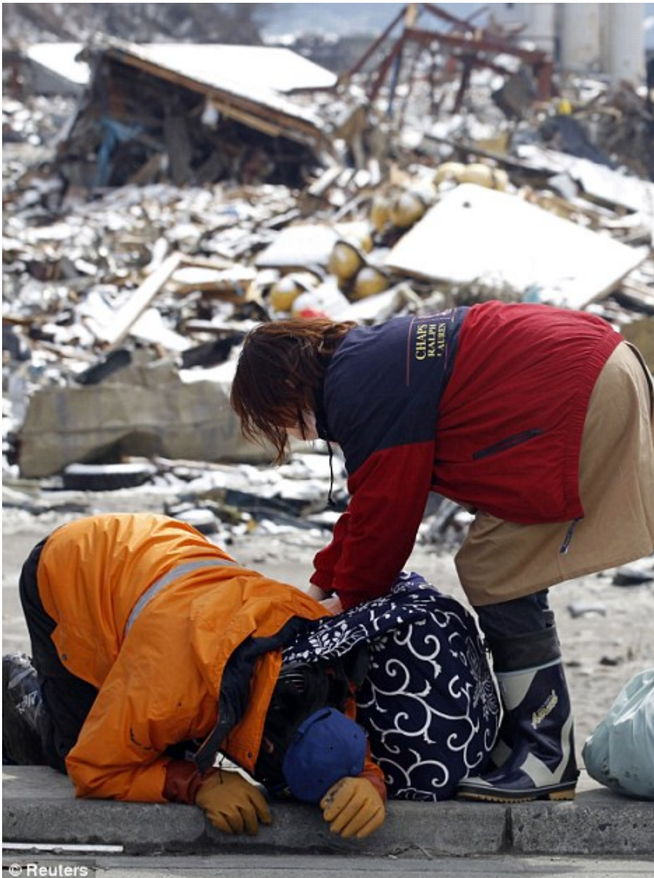
Japanese firefighters gently lower the body of a victim from a two-storey house in Kamaishi (left) while the devastation is too much for one man after he collected his belongings in Otsuchi