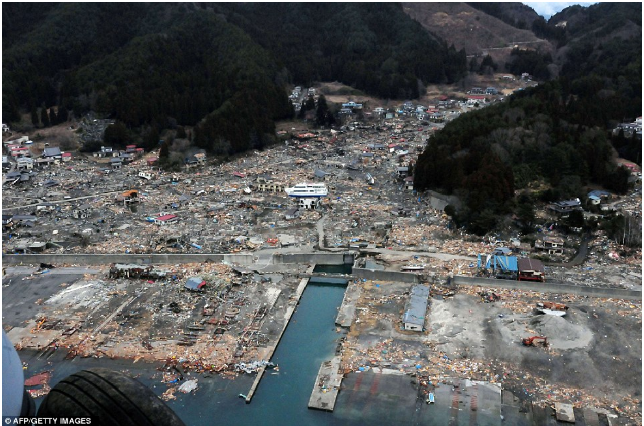
Horrifying: An aerial shot shows the devastated centre of Wakuya. A boat sits on top of a building at the centre of the picture