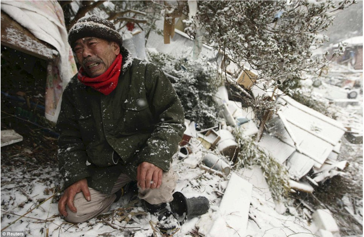
Heartbreak with no end: A man cries next to his destroyed house where his dead mother is still buried in the rubble in Onagawa