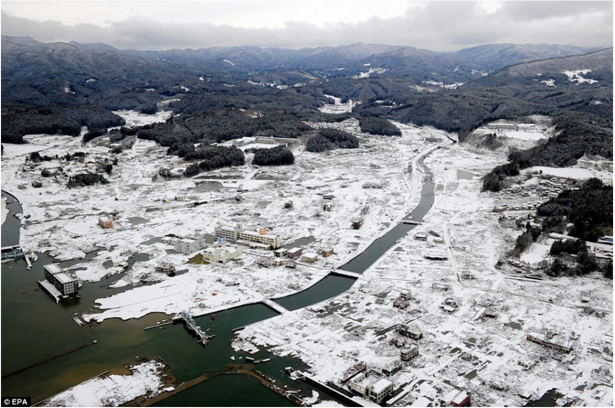
After the tsunami, the snow: This aerial view shows how the devastated town of Minamisanriku in the prefecture Miyagi was dusted in white falling a snowfall