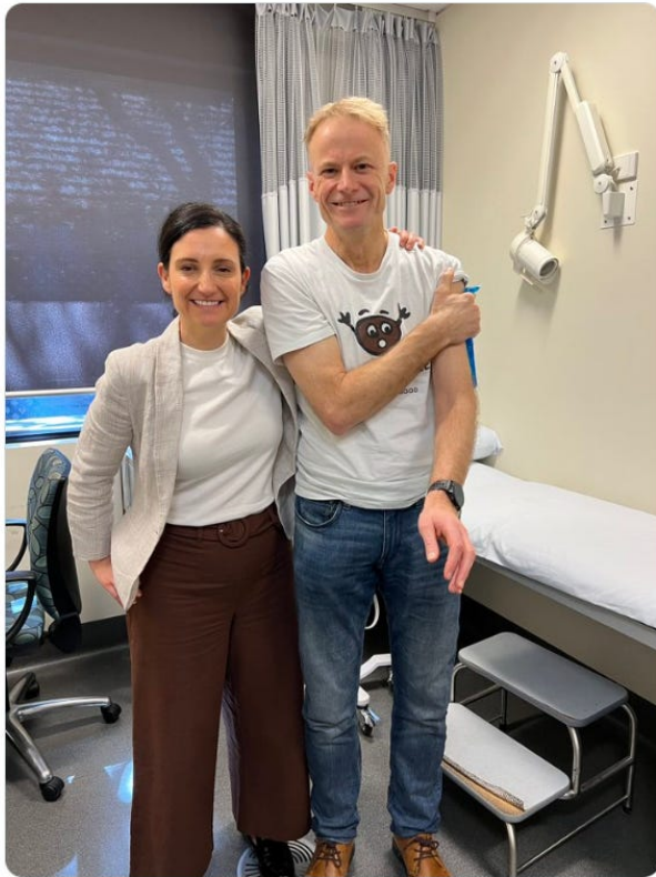
Melanoma Institute Australia and 8 others