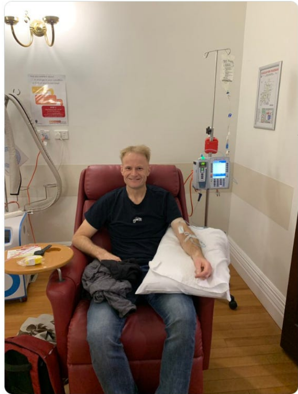
Melanoma Institute Australia and 9 others

Energy levels picking up. Tweaking antiepileptics ➡ refining my moods (yay say close family/friends)! Excited re more #immunotherapy today. 🙌 my body can handle added challenge. Massive thanks to @ProfGLongMIA for all she is doing to support me & push boundaries in #glioblastoma!