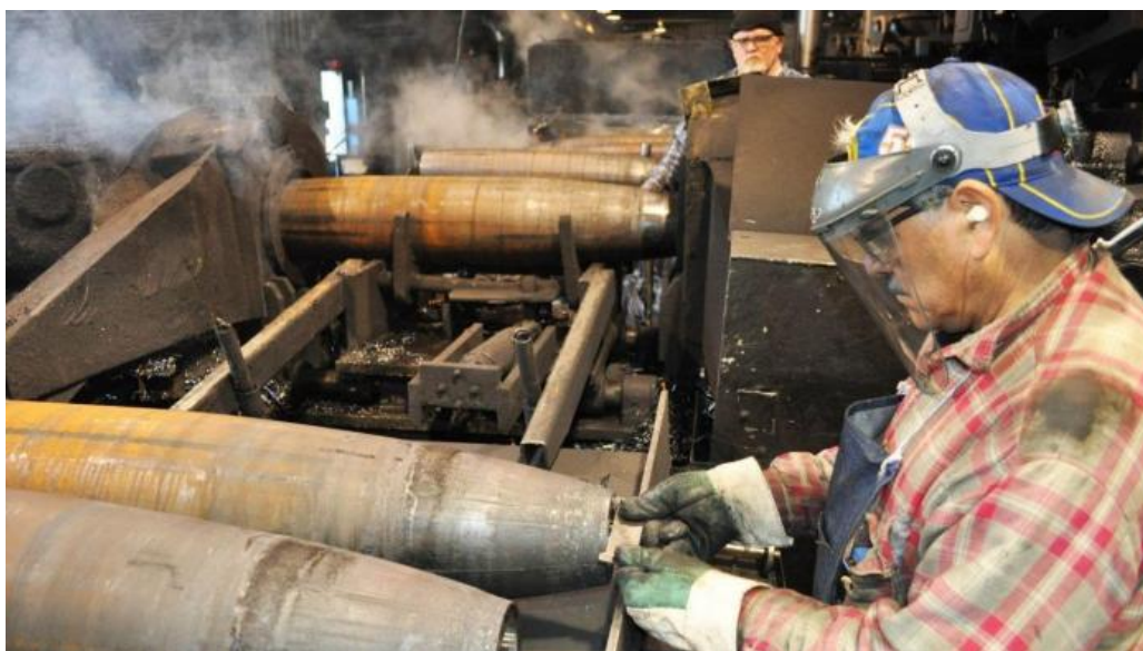
A worker at the General Dynamics Ordnance and Tactical Systems, Inc., plant in Garland, Texas, works on the MK-80 series of bombs.

The bombs include MK-80 bombs made by General Dynamics in Garland, Texas, and retrofitted in McAlester, Oklahoma, at the McAlester Army Ammunition Plant, which produces a wide variety of bombs, including the infamous Massive Ordnance Air Blast (MOAB) bombs dropped on Afghanistan, whose yield is comparable to a tactical nuclear weapon. [3]