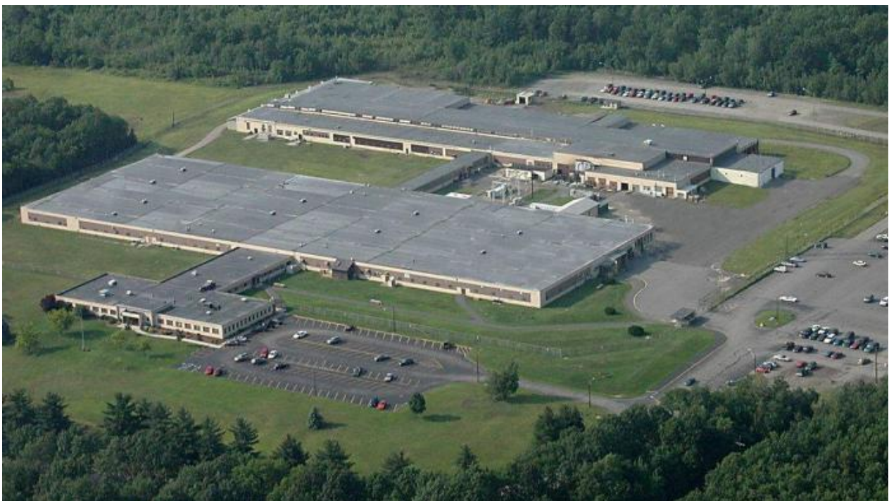
Lockheed’s Archbald plant, where smart bombs used by the IDF to kill Gazan civilians are manufactured.

According to the wsws , the MK-80 is a “primary bomb being used by the IDF as it destroys Gaza.” The IDF has also likely been using GBU-12 (Paveway) laser-guided bombs manufactured by Lockheed at its plant in Archbald, Pennsylvania, that are dropped from Lockheed F-35 fighter jets manufactured at a Lockheed plant in Fort Worth, Texas.