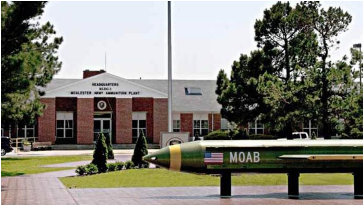
McAlester Army Ammunition Plant where they are proud of their deadly creation.

According to the wsws , the MK-80 is a “primary bomb being used by the IDF as it destroys Gaza.” The IDF has also likely been using GBU-12 (Paveway) laser-guided bombs manufactured by Lockheed at its plant in Archbald, Pennsylvania, that are dropped from Lockheed F-35 fighter jets manufactured at a Lockheed plant in Fort Worth, Texas.