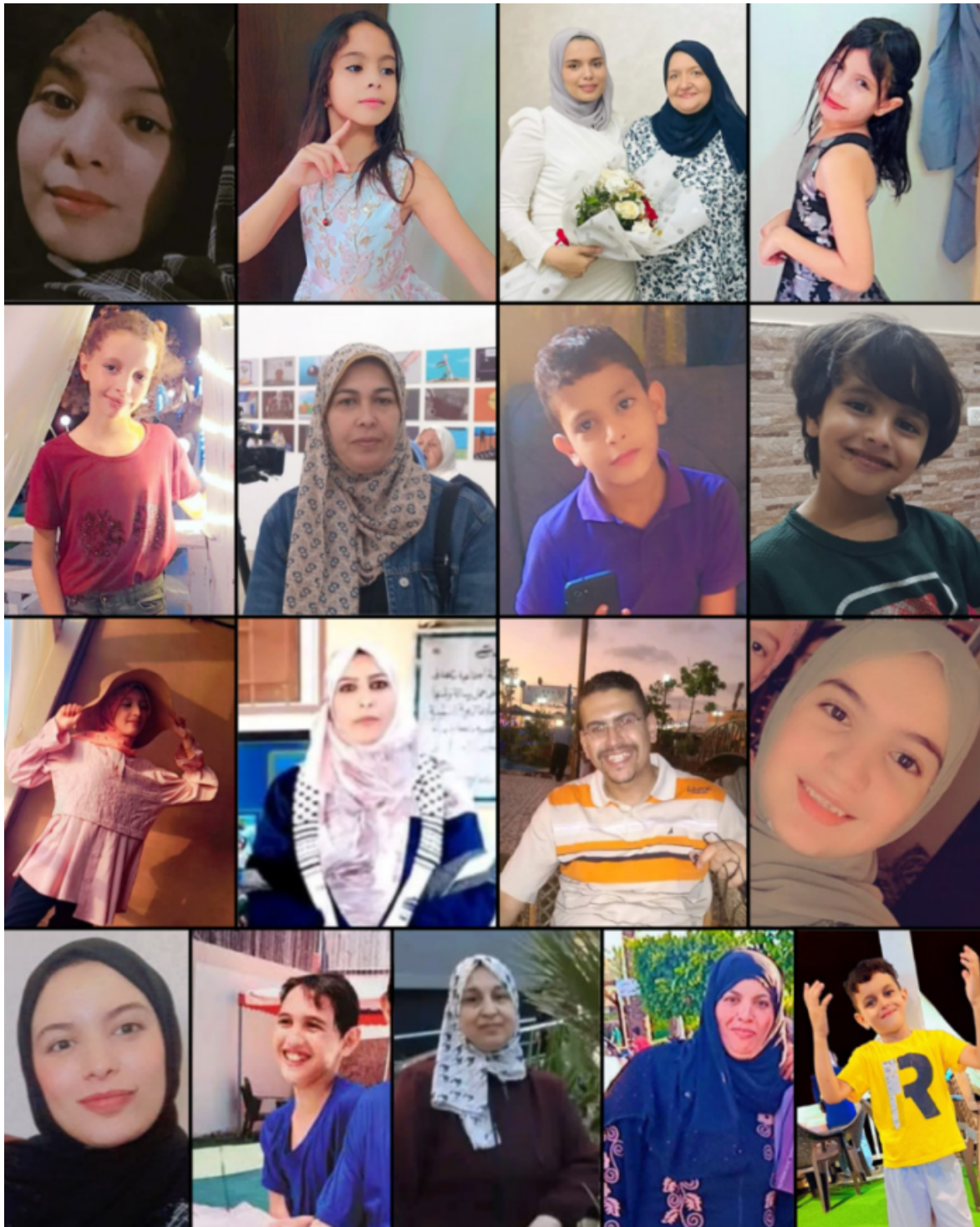
Members of the Abu Mu'eileq family who were killed in the strike.

Amnesty has also raised alarm at the use of white phosphorus bombs in Gaza in violation of international law that it believed “may have been exported” from the U.S. In the 2008-2009 Operation Cast Lead, Israel used white phosphorus bombs that had been produced in Louisiana and Arkansas.