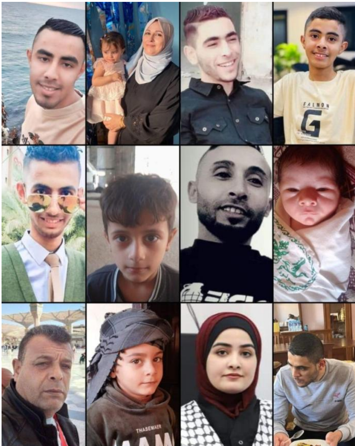
Members of the al-Najjar family who were killed in the strike.