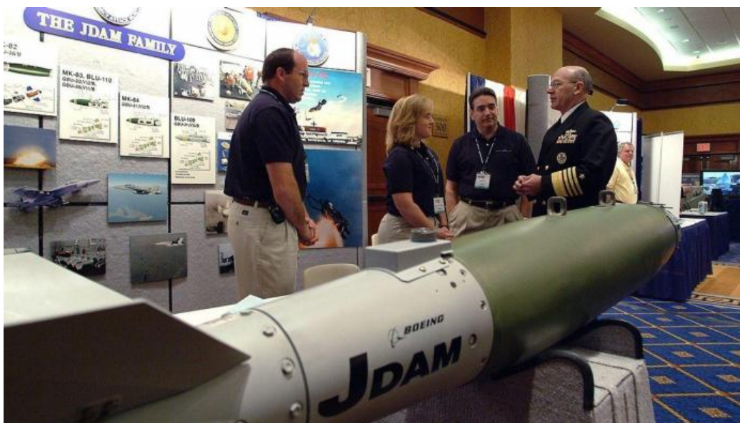
A Joint Direct Attack Munition (JDAM) kit fixed to a bomb on display at the Navy League’s 2003 Sea-Air-Space Exposition.

In December, Amnesty International carried out an investigation , which determined that Joint Direct Attack Munitions (JDAM) manufactured by Boeing at a factory in St. Louis, Missouri, were used by the Israeli military in two unlawful air strikes on homes full of civilians in the Gaza Strip on October 10 and 13, with the fragments from the bombs found in the rubble.