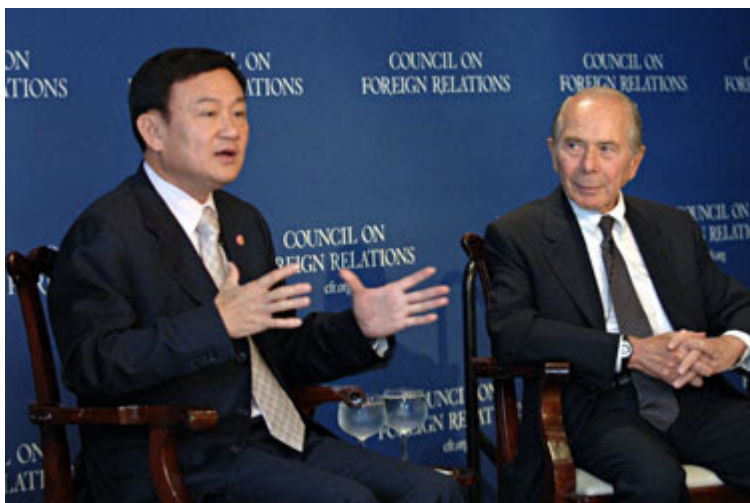
Photo: Thaksin Shinawatra, a long time servant of the global elite, since before even becoming Thailand's prime minister in 2001, reports to the CFR in New York City on the eve of the 2006 military coup that ousted him from power. He has now returned to power in Thailand via a proxy political party led by his own sister, Yingluck Shinawatra. Securing the votes of only 35% of eligible voters puts on full display how tenuous his support really is within a nation he claims stands entirely behind him.