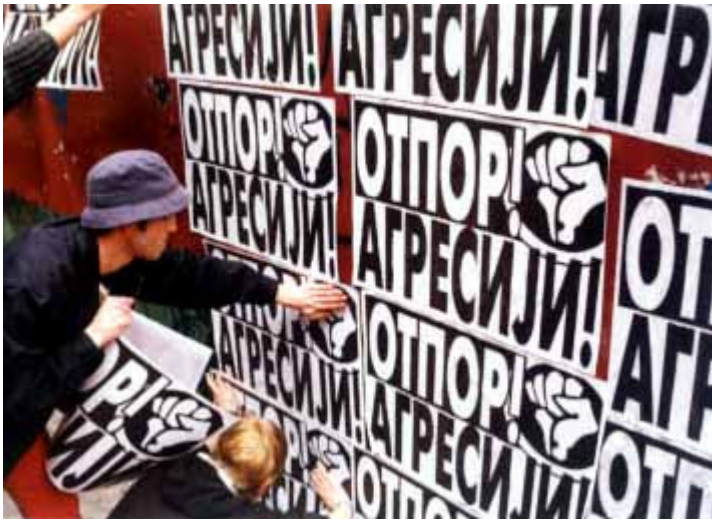
Photo: Serbia's "Otpor," a model for future US-backed color revolutions.