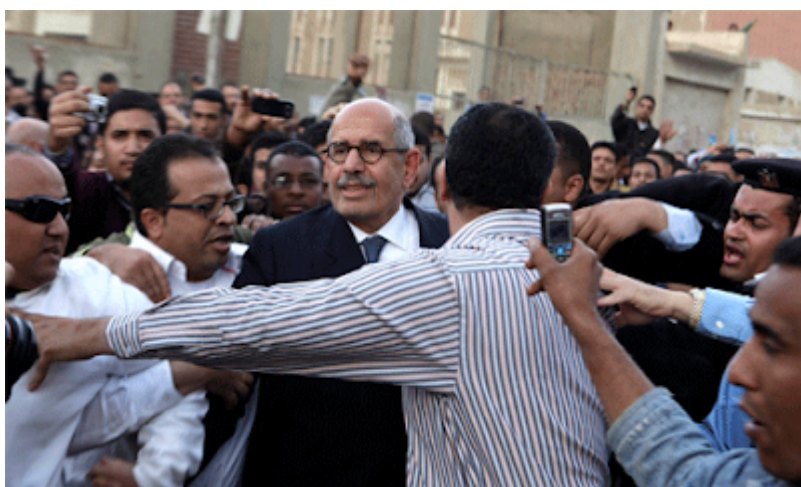
Photo: The “barrier of legitimacy” is broken: a mob shouts “American agent”

March 26, 2011: In Egypt, signs of a counterrevolution and the first signs of weakness in ElBaradei’s chances to be installed as president began to show. Mobs pelted ElBaradei with rocks calling him “ an American agent .” Wikileaks would again come to the aid of US interests and try to reintroduce the “anti-Western” image ElBaradei had been hamfisted in portraying.