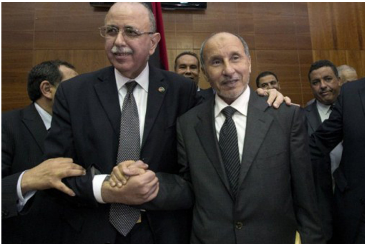
Photo: And so begins the farce that is Western “democracy.” One corporate puppet Mahmoud Jibril , steps down, another, Abdurrahim el-Keib, takes his place. In reality, it is NATO-states and their corporate sponsors that now determine Libya’s fate. Pictured above, el-Keib poses with Mustafa Abdul-Jalil, chairman of the unelected, NATO-backed “National Transitional Council.”

Also in November, Wall Street and London’s assault on Libya came full circle with the installation of Abdurrahim el-Keib as prime minister. El-Keib who spent decades in exile in the US, was formally employed by the Petroleum Institute, based in Abu Dhabi, UAE and sponsored by British Petroleum (BP), Shell, France’s Total, the Japan Oil Development Company, and the Abu Dhabi National Oil Company.