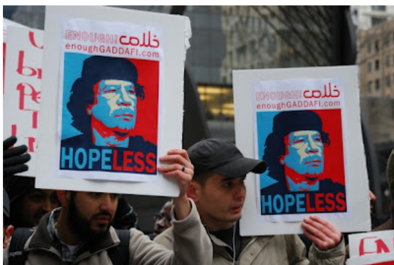
Photo: Please note the “EnoughGaddafi.com” signs. EnoughGaddafi.com’s webmaster is listed on the US State Department’s Movements.org as the “Twitter” to follow.