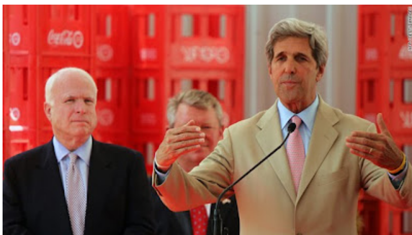
Photo: McCain (left) and Kerry (right) gesticulate as they explain their paymaster's agenda within the confines of an Egyptian Coca-Cola factory. This is part of their latest trip surveying the effects of their US-funded opposition overthrowing Hosni Mubarak's government.

June, 2011: In " Arab Spring brings Corporate Locust ," the true agenda behind Egypt's, and indeed the entire "Arab Spring's" unrest became apparent as US representatives gave Fortune 500 executives a tour of destabilized Egypt and Tunisia in an effort to promote economic liberalization and privatization. John McCain and John Kerry led the tour and had co-sponsored bills to promote what would essentially be the meshing of Egypt and Tunisia's economy into the Wall Street/London international order.