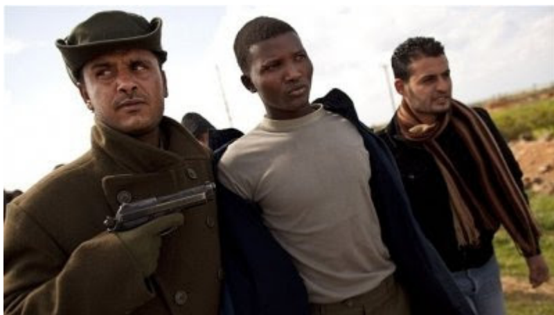
Photo: Libya's rebels are far from motivated by democratic aspirations. Their grievances lie along ethnic, not political divides. "Gaddafi supporters" is the euphemism being used by the global corporate-media in describing the generally darker skinned and African tribes and who are bearing the brunt of

By late August, NATO began a coordinated attack on Tripoli, Libya, involving an elaborate psychological-operation that claimed to have eliminated or captured the entire Qaddafi family in a single day. The following day, Saif Al-Qaddafi would turn up alive and well, and free, while leading fierce fighting that would carry on until October and result in NATO leveling the cities of Bani Walid and Sirte in particular, into piles of rubble. It had become entirely clear that NATO was providing air support not for democracy-loving freedom fighters, but for hardcore terrorists who were carrying out a systematic campaign of genocide and reprisals throughout the country.