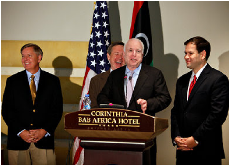
Photo: It's all smiles and laughs in Tripoli as McCain, a chief proponent and driving force behind the US intervention in Libya, literally glorifies Al Qaeda's exploits in the now ruined nation. Miles away, the very rebels he was praising are purposefully starving the civilian population of Sirte in an effort to break their will, while they and NATO indiscriminately use heavy weapons aimed at crowded city centers.