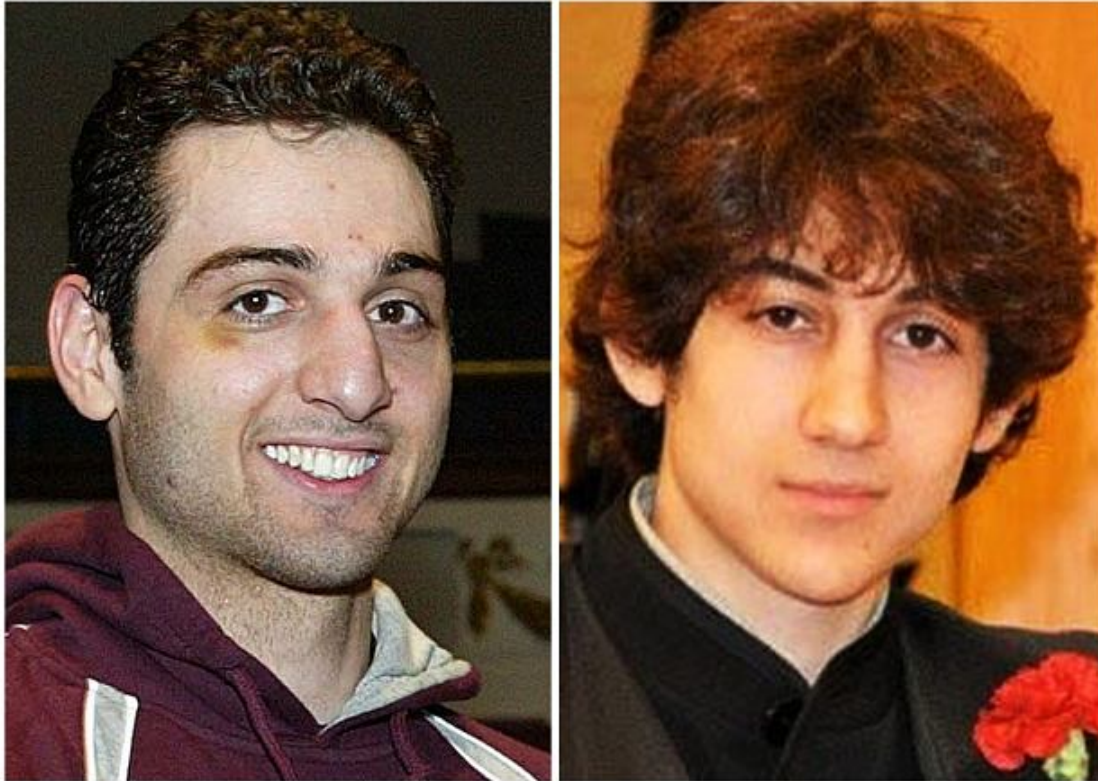
PHOTO: Tsarnaev brothers were likely set-up to take the fall by FBI or other federal officials.

More interestingly, MSNBC expert Engel also let slip on air that suspect number two, Dzhokhar, who is now in hospital care, “was probably being debriefed”. This was an odd phrase to attach to an alleged terrorist fugitive.